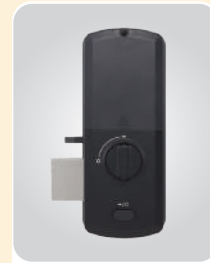
Stainless Steel Lock