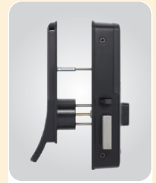
Fit on Thin Doors 25mm thickness