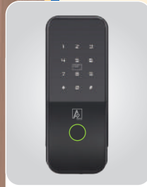
RF Semiconductor Fingerprint (Back side)